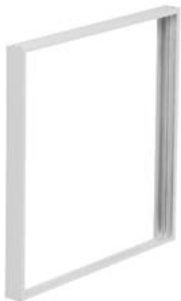
RIM-P26SM Surface Mount