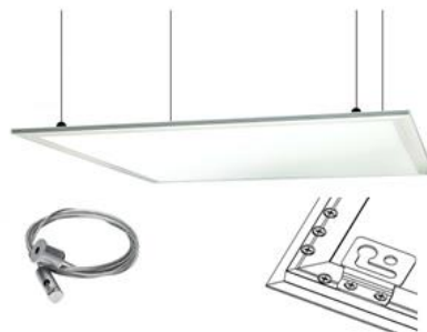
RIM-P26CSC Ceiling Suspension Cable Kit