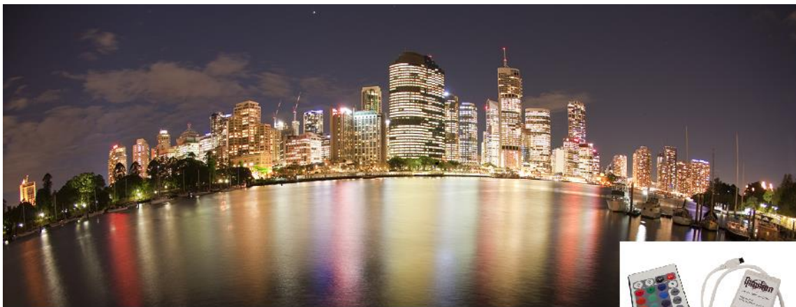
Optional RIM-RGBC 24key infrared RGB controller